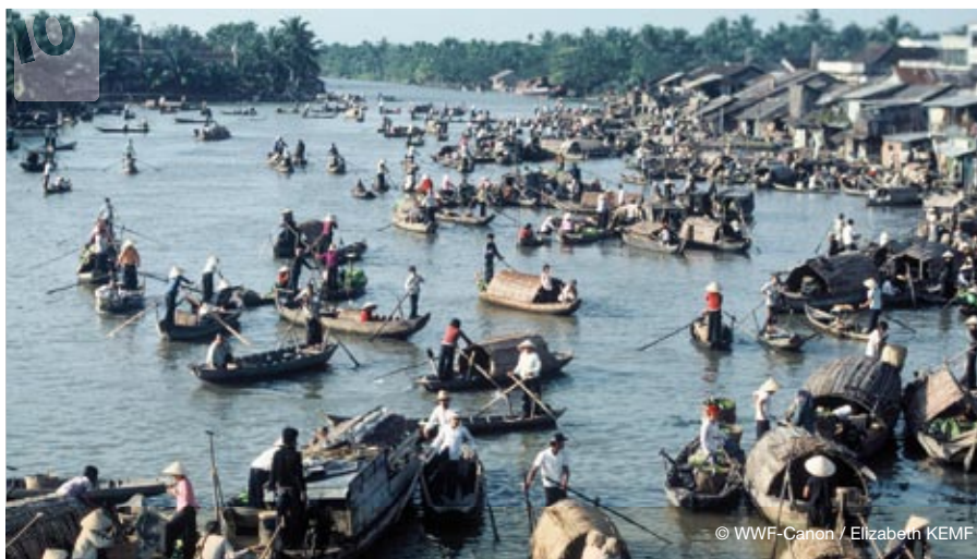
Sampans meet at early morning market in the Mekong delta. Vietnam.

In 1995, all basin countries except the two upper basin states, China and Myanmar, signed the Mekong Agreement and revitalized the Mekong River Commission 66 to promote cooperative management of the river (Water Policy International Limited 2001). Though the Commission has made progress in its relations with China and Myanmar in sharing information on fisheries and hydrological data, insufficient attention has been paid to halting overfishing throughout the basin. Areas threatened by overfishing need better institutional capacity to create and enforce legislation on fishing methods and rights. In addition, community-based fishing cooperatives, improved communication between stakeholders and integrated basin management are essential in protecting beneficial flooding and the Mekong River's resources.