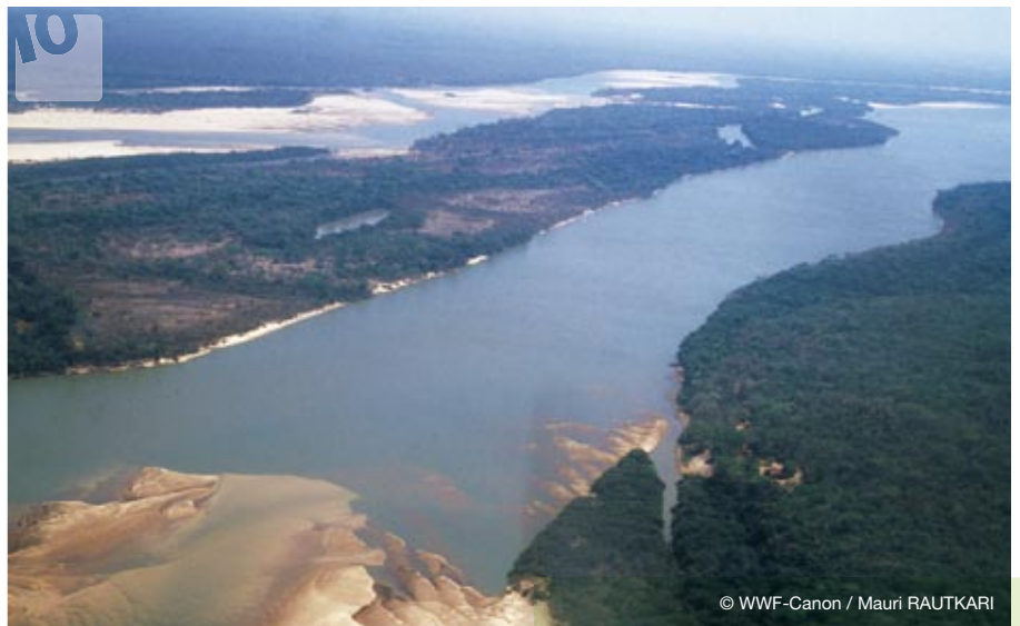
Aerial view of the Paraná River, Paraná, Brazil.

conducted collaborative research which led to a joint conservation strategy for over 1 million ha of contiguous Atlantic forest, and is an important step towards cooperative management of the region's Iguazu National Parks. Finally, WWF is seeking to develop representative protected areas in the Brazilian Pantanal, through the use of innovative incentives and policy mechanisms 34 , and plans to investigate a range of approaches to participatory involvement for local communities and government authorities.