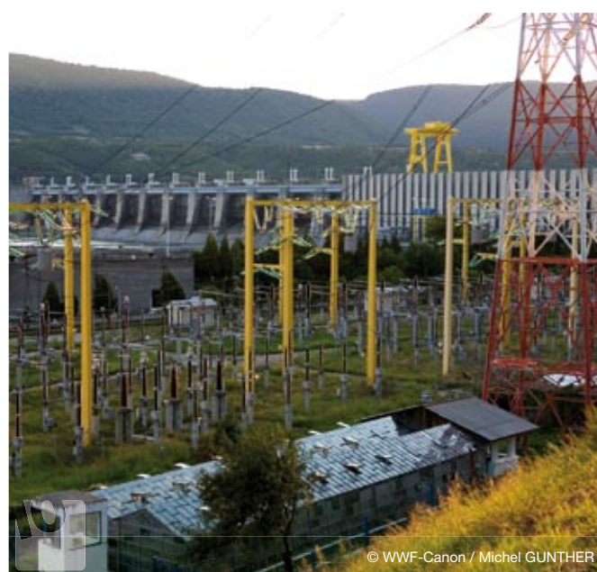
Hydro electric power station on the Danube River, Romania. The construction of this dam caused a 35 m rise in the water level of the river near the dam. The old Orsova, the Danube island Ada Kaleh and at least five other villages, totalling a population of 17,000, had to make way. People were relocated, but the settlements have been lost forever to the Danube.