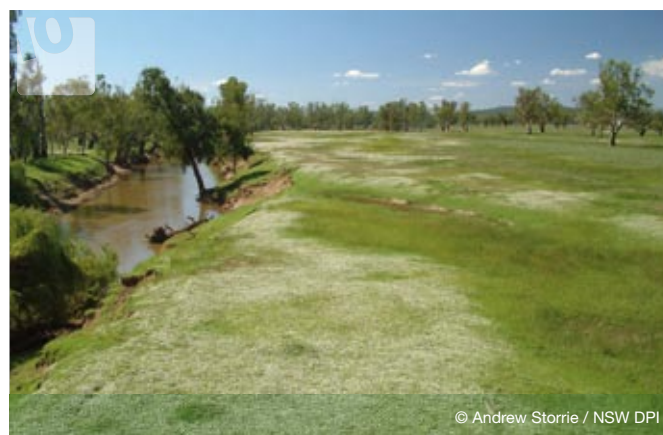
Flowering Lippia infestation along banks of Namoi River, near Boggabri, NSW, February 2004.