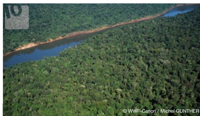
Iguazu National Park - Paraná River Atlantic Rainforest Paraná, Brazil.