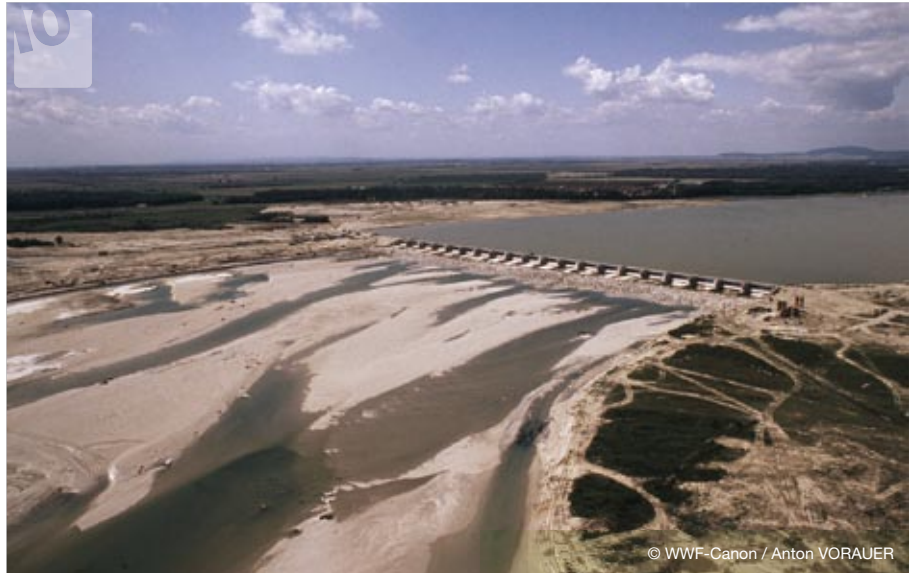
Dam on the Danube River.

In 2000 WWF facilitated a heads of state summit of basin governments. They pledged to protect and restore 600,000 ha to establish a 'Lower Danube Green Corridor' of restored riparian lands for nature conservation, water quality improvement, better flood management, and development of sustainable livelihoods for local people. Progress in implementing this commitment has been slow. It is likely, however, that had the pledged restoration been implemented, the floodplains would have mitigated the 2006 lower Danube floods by holding and safely releasing the water. In 2003, WWF completed the official 'Danube River Basin Public Participation Strategy', to contribute towards the implementation of the EU Water Framework Directive in the basin (Jones et al. 2003).