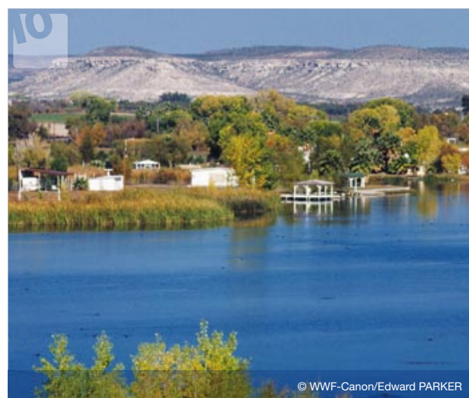
The Rio Conchos is the main source of irrigation water for crops (cotton & alfalfa) grown in the state of Chihuahua, Chihuahuan Desert, Mexico.

The Rio Grande basin is a globally important region for freshwater biodiversity (Revega et al. 2000). The Rio Grande supports 121 fish species, 69 of which are found nowhere else on the planet. There are three areas supporting endemic bird species as well as a very high level of mollusk diversity (Revenga et al. 1998; WRI 2003; Grommbridge & Jenkins 1998).