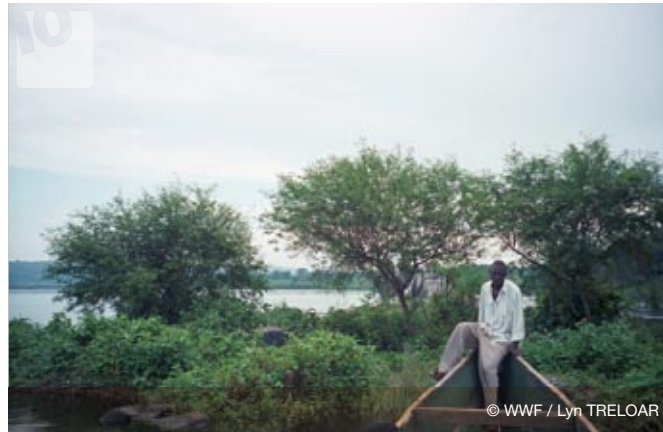
The Lake Victoria source of the Nile. The river originates from two distinct geographical zones, the basins of the White and Blue Niles.

In the Mara river watershed in Kenya and Tanzania, which drains into Lake Victoria, WWF is facilitating stakeholder dialogue on integrated river basin management for regional and district government institutions, non-governmental organizations and communities. This includes work to: protect the forest sources of the river on the Mau escarpment, model environmental flows, and develop water sharing agreements needed to sustain people and nature along the river.