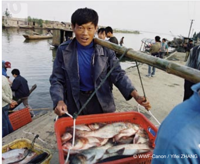
Fishing is a main livelihood on Zhangdu, site of consevation work supported by the WWF HSBC Yangtze Programme, Hubei Province, China.

In the past year, Chinese government authorities, with support from WWF, have taken steps toward developing an integrated basin management plan which would help stem the threat of pollution in the Yangtze. Integrated river basin management (IRBM) is vital to enable communities to restore the natural capacity of their watershed to 'treat' pollution. IRBM is a tool communities can use to balance development and conservation needs, such as whether to construct dams or diversions, which severely affect quality of water in a basin.