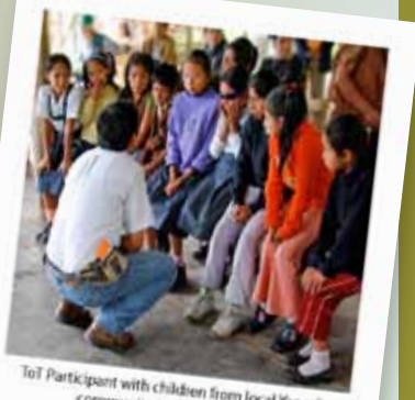
om local Yanesh iunity in Peru, May 2001

In May 2009, CSU conducted the first ToT course in Yanachaga-Chemillen National Park, Peru. This 12-day course brought together 20 training experts from NGOs, indigenous reserves, national parks, and training provider organizations