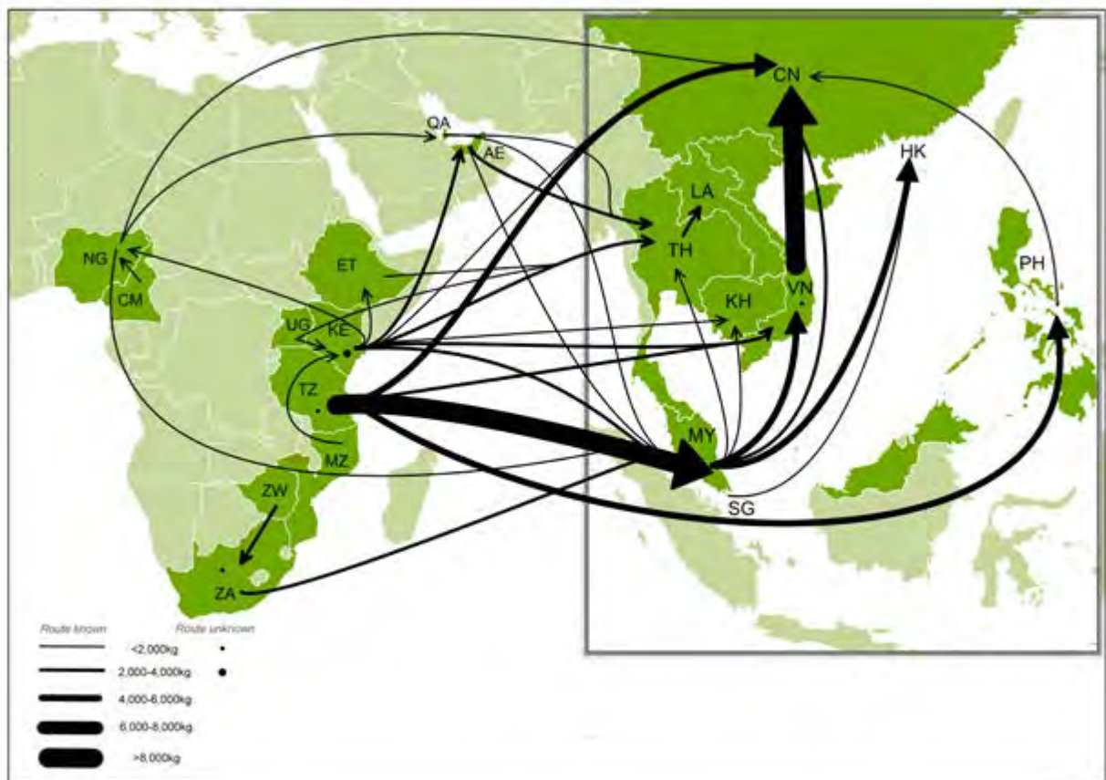
FIGURE 1 Trade routes for large-scale (>500 kg) seizures of ivory, 2009 - 2011 (ETIS, 03 November 2013).

In 2011, poaching levels, estimated from elephant carcasses, were the highest in a decade, while in the same year a record quantity of ivory was seized worldwide: 50.7 tonnes. It is believed that illegal trade in ivory has trebled since 1968 and more than doubled since 2010.