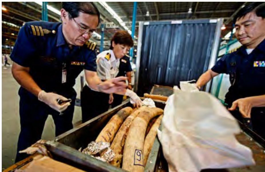
Customs officials in Suvarnabhumi Airport, Thailand discover a shipment of African Elephant tusks from Mozambique. Suvarnabhumi is a major hub for wildlife.

Although Thailand has previously indicated that Customs has made 17 ivory seizures since 2008, only 12 cases have been reported to ETIS from 2008 through 2011. Thailand is also often implicated in seizures reported by other countries and the country ranks in the mid-range in terms of the relative number of seizures made. However, considering the weight of seizures made, they are substantial. Overall, Thailand's strategy may prevent some large shipments of ivory from being imported and reaching the retail market, but if raw ivory shipments go undetected at the point of entry, the ivory is seemingly processed and freely marketed with very little intervention once inside the country.