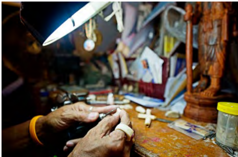
An ivory carver at work in Payuhakirri, Thailand.