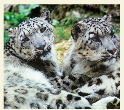
Opposite: Black-necked cranes. Above, L to R: Bengal tiger; blood pheasants; takin; snow leopards

This abundance of pristine protected areas is a haven for wildlife.