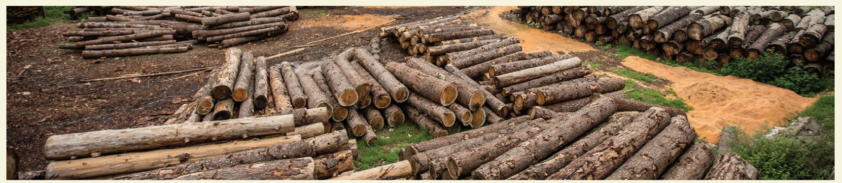
Opposite: Electricity switching station. Above: Logging is on the rise.

The Bhutanese government wants to address all these new threats and protect the conservation investment it has built up. It has goals to increase enforcement, provide training programs for rangers and local people, and develop job opportunities for people in rural areas. Of course, all this requires funding beyond what has previously been allotted for conservation.