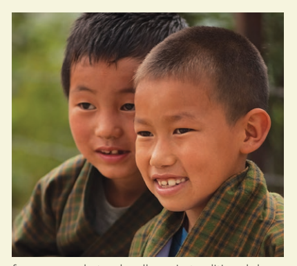
Opposite: View over the Himalayas from the Royal Botanical Gardens. Above, L to R: Senior monks gather at a monastery; traditional painting; incense at a farmers market; schoolboys in traditional dress

For decades, the government of Bhutan has stayed true to its commitments. It has worked closely with WWF to build this treasure so that both conservation and economic development can occur in a balanced, sustainable way.