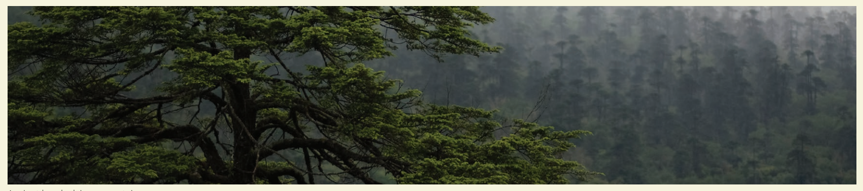
Ancient hemlock in a mountain pass

In Bhutan, environmental protection has always been considered vitally important to the nation's Buddhist values. So much so that beginning in the 1970s Bhutan's monarchs began championing visionary conservation policies. And when Bhutan recently transitioned into a democracy, the monarchs' profound conservation legacy was continued by the new government, which literally wrote conservation into the country's first constitution.