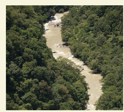
L to R: Red panda; prayer flags over Paro Valley; painter working on a homestay; river curving through forests in rural Bhutan. Opposite: Monk in Punakha Dzong

Your support of the Bhutan for Life project is more than just a financial contribution. It's a legacy for a lifetime—and beyond.