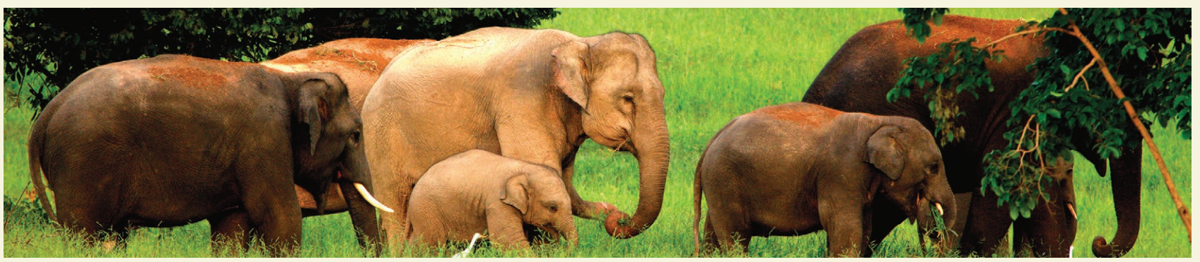
A herd of Asian elephants. Opposite: A farmer and his dog stand guard against wild animals that might raid his crops at night.

As nearby countries have depleted their own natural resources, their sights have turned toward Bhutan's attractive natural riches. This has brought some serious new problems to the country.