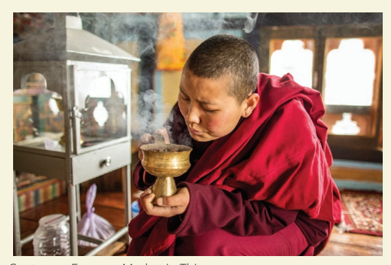
L to R: A local hotel manager books reservations; a tributary of the Thimpu River; a Bhutanese nun makes an incense offering. Opposite: Centenary Farmers Market in Thimpu

The nation's natural richness doesn't just help wild species. It helps people, too.